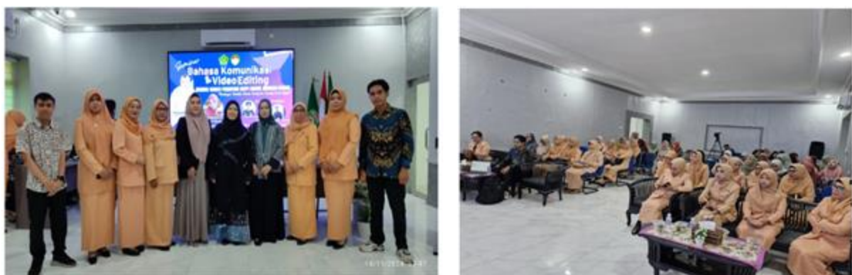
FIGURE 3. Seminar Activities

Strategies for public speaking, video composition and visual aspects, video shooting procedures, and an overview of video editing and graphic design software in CapCut are among the things covered.