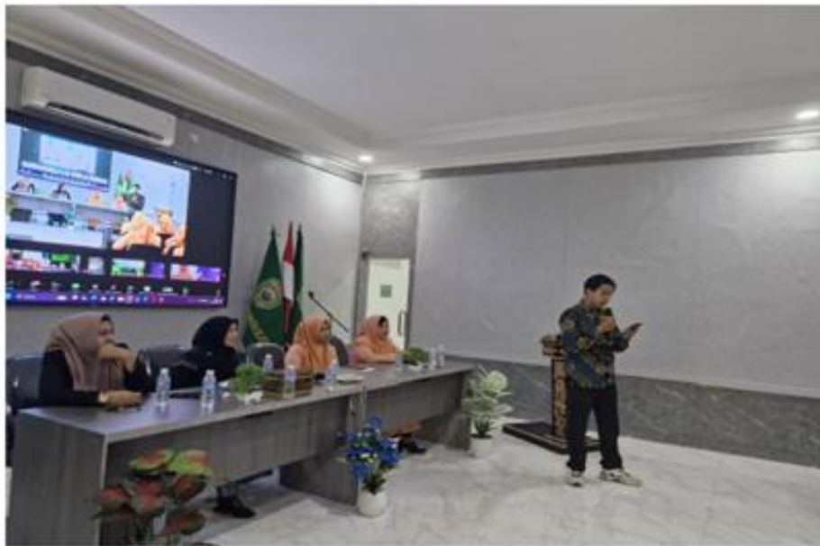
FIGURE 4. Workshop Using CapCut

layouts and backgrounds, uploading images, and creating captivating animations were explained to the participants. A demonstration of video editing with the CapCut application concluded the second session. They learned how to use the application's functions, including how to upload and mix movies, add sound, add animated images, make layouts, add text, alter colors, and create video transitions.