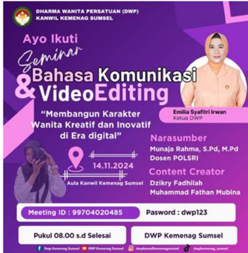
FIGURE 2. Project Activities

On November 14, 2024, this community service project was completed at the South Sumatera Religious Affairs Department in Palembang. Forty-five members of the Women's Association of the Department of Religious Affairs participated. They were the target audience for this initiative; however, anyone could attend the course. Through the demonstration and practice of editing techniques, public speaking, and basic video editing using CapCut were conducted.