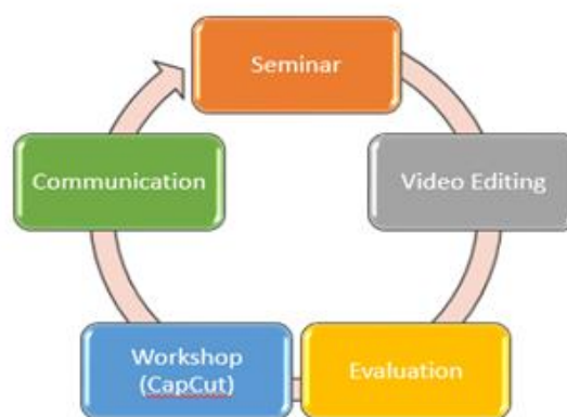
FIGURE 1. Project Activities