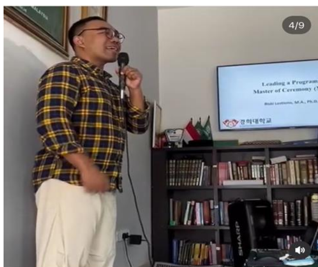
FIGURE 5. Presenter Demonstrates Diaphragm Breathing Techniques

In the following picture, the presenter demonstrates the technique of speaking with a diaphragm voice that is useful for maintaining voice stability and improving the quality of articulation of an MC so that he can perform professionally and confidently (Kustiawan dkk., 2023).