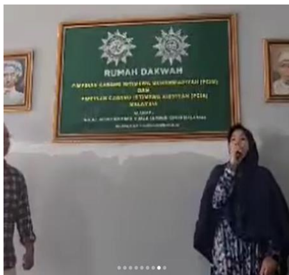
FIGURE 6. Participants simulated the role of MC

In the following picture, the presenter gave input to the participants regarding good and correct vocal processing techniques to get a loud voice.