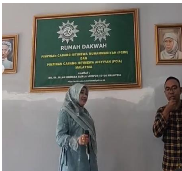
FIGURE 7. Presenter Provides Input to Participants

In the following picture, the presenter gave input to the participants regarding good and correct vocal processing techniques to get a loud voice.