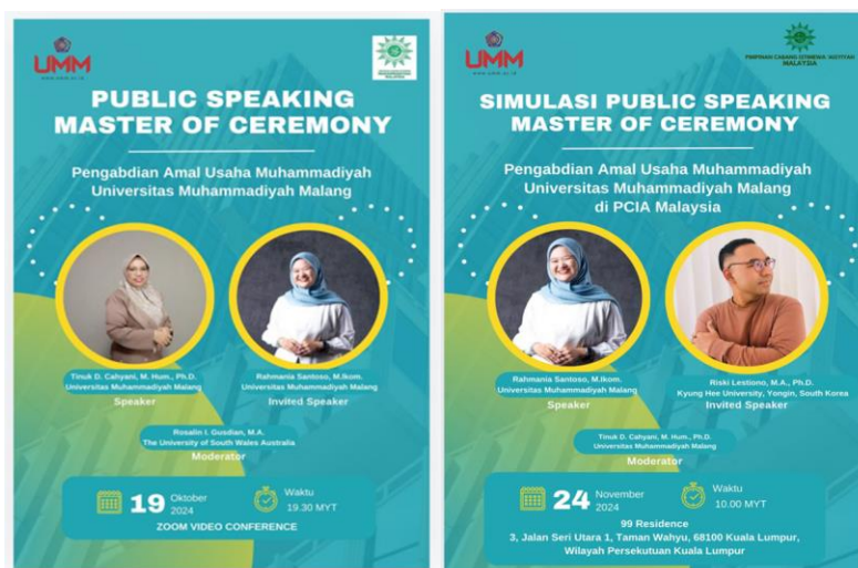
FIGURE 1. Public Speaking Online Training Method

The method of implementation in the service of training and public speaking – master of ceremony (MC) for the Cadres of the Leadership of the Special Branch of Aisiyyah Malaysia is the socialization method carried out as the first step for the introduction and approach to all cadres, the lecture method used to provide material, the training and guidance method aims to guide and train cadres so that they can appear confident and professional. In accordance with the activity proposal, we carried out this service 4 times consisting of 3 basic MC training in the network and 1 time offline workshop which was held at the Da'wah Building of the Muhammadiyah and Aisiyyah Special Branch Leaders Kuala Lumpur. However, due to the situation that does not allow participants from PCIA Kuala Lumpur to carry out all activities, it was agreed to carry out training 2 times with details 1 time online and 1 time offline. Online activities will be held on Saturday, October 19, 2024 at 19.30 - 22.00 WIB and offline activities will be held on Sunday, November 24, 2024 at 09.00 – 13.30 MYT. Here are the flyers for the two activities.