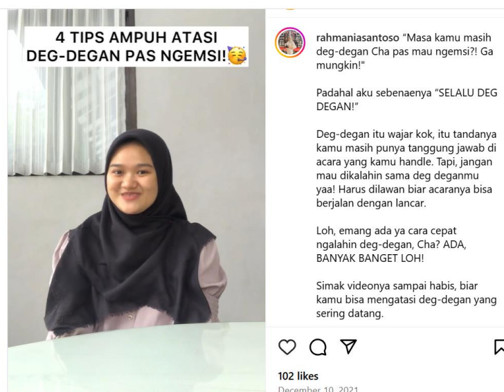
FIGURE 4. MC Tips Instagram Content

In the real practice or simulation activities carried out directly in Kuala Lumpur, the trainees not only practiced how to become an MC according to the script that had been given, but the participants also learned to use diaphragm sounds. Using diaphragm voices, the participants practice to become MCs with a clear voice in order to increase confidence in carrying out MC duties for PCIA's internal routine activities as well as external activities for the needs of PP Aisyiyah at home and abroad.