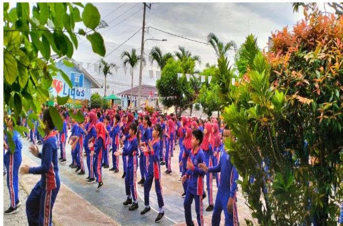
FIGURE 5. Exercise

This community service activity also applies to health literacy. Health literacy is one method to convey health information to students so that health behavior can be applied in everyday life (Khairina et al., 2022). Health literacy skills are described as a person's ability to read, write, and understand information. Someone who has difficulty reading will also have difficulty understanding information (Mbanda et al., 2020). Health behavior includes health checks, sanitation and hygiene, and physical activities such as gymnastics. The activity begins with doing physical activities such as gymnastics together. This activity is guided directly by the community service team.