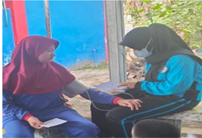
FIGURE 6. Measure Blood Pressure

After the physical examination was completed, the activity continued with an educational session conducted by the community service team, assisted by nursing students from the Citra Internasional Institute. The students provided education on Clean and Healthy Living Behavior (PHBS). PHBS refers to behaviors practiced by individuals or communities to maintain personal health independently to prevent disease and actively contribute to improving public health (Nurmahmudah et al., 2018).