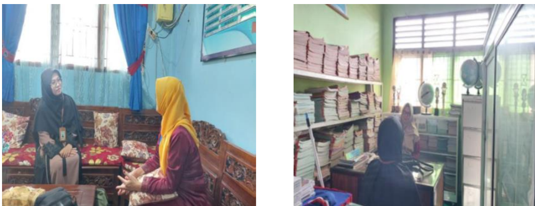
FIGURE 1. Field observation with the Headmaster and Head of the Library

Based on these issues, the community service team partnered with SD Negeri 15 Pangkalpinang for this initiative. SD Negeri 15 Pangkalpinang is a public elementary school located on Jl. Usman Ambon in Pangkalpinang City. This school began its teaching and learning activities in 1961 and continues to operate today. Students at SDN 15 Pangkalpinang have achieved many accomplishments. However, despite these successes, SDN 15 Pangkalpinang faces challenges in reading literacy. This was noted by the principal of SDN 15 Pangkalpinang and the head of the library during the community service team's visit to the school.