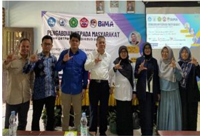
FIGURE 3. Invited Guests in Community Service Activity

This counseling activity went smoothly and enthusiastically. This is because of the many questions from teachers and parents of students regarding the importance of literacy and the effects of violence on child psychology.