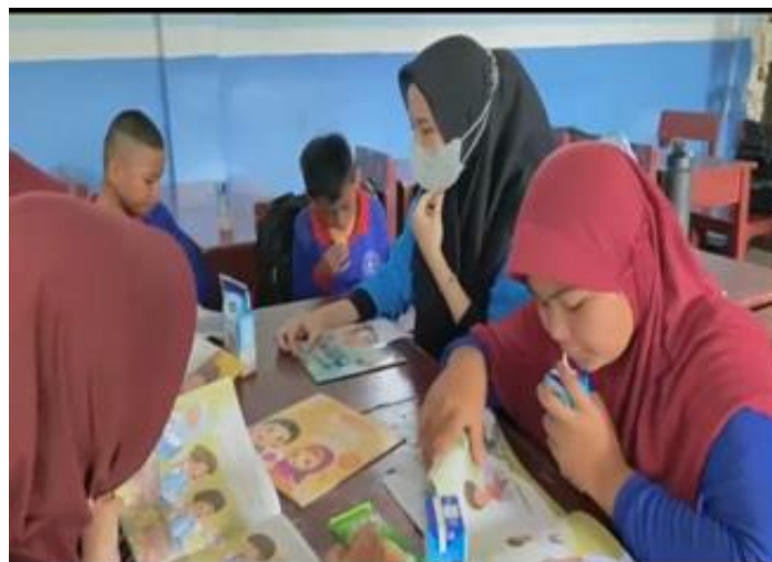
FIGURE 4. Book Reading Activity

After being given counseling regarding the importance of literacy culture. Students are divided into several groups. Each group is given a book that they will read during the activity. This activity is accompanied by the proposing team and students of the Citra Internasional Institute. The book reading activity lasts for a month. This is done to train a love of literacy culture in schools. On the following day, this reading activity is guided directly by the homeroom teacher. The sample in this literacy movement is class VI (A) students.