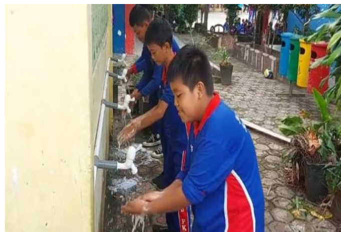
FIGURE 7. Measure Blood Pressure

To provide a clearer understanding of proper handwashing with soap, a handwashing video accompanied by music was shown to engage the children and encourage them to imitate the demonstrated movements. After watching the video, the activity moved to the demonstration stage, where the children practiced proper handwashing techniques using running water. This activity not only offers theoretical knowledge, but also allows students to practice handwashing with water flows.