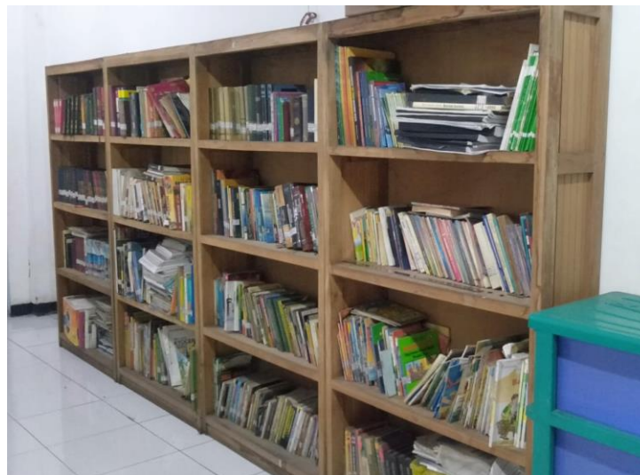
Figure 2. Arrangement of bookshelves in the mini library